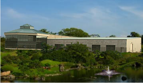
The RV/MH Museum,