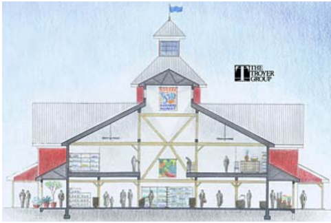
American Countryside Farmers Market,

www.americancountryside.us/market/about/ NOTE: OPTION CANCELLED BUT YOU MAY WANT TO VISIT ON YOUR OWN.